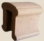
Monarch Wall Cap